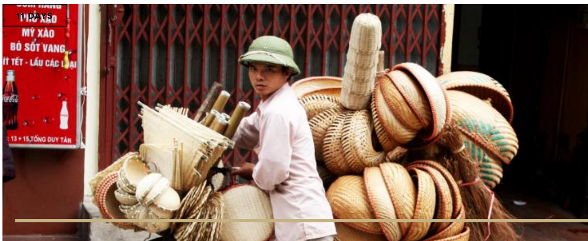
Hanoi and Hoi An Multi Centre

Experience the best beauty spots and cultural highlights on our Hanoi tours as you discover Vietnam's beaches, forests, rice paddies and cities. Get inspired by our selection of popular itineraries for Hanoi holidays. With so many options for your Hanoi holiday package, we recommend you talk to one of our Destination Specialists to make the perfect tailor-made holiday just for you.