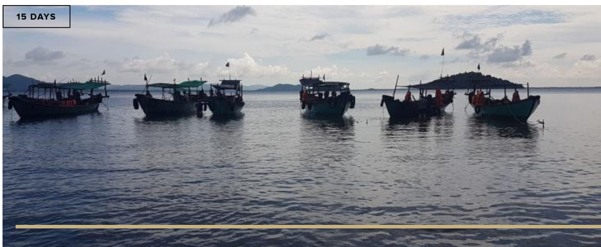
Grand Tour of Indochina