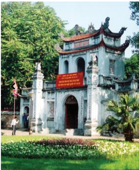
Temple of Literature

Held between January and April, Perfume Pagoda Festival is a religious event that attracts pilgrims from across Vietnam and beyond. Join locals at this spiritual site of shrines and temples and make the walk up to Thien Tru Pagoda before saying a prayer in the ancient sacred cave, Huong Tich. Make a wish for the year ahead and enjoy this unique insight into Vietnamese culture.