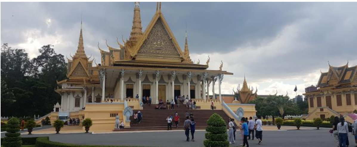
CAMBODIA Phnom Penh