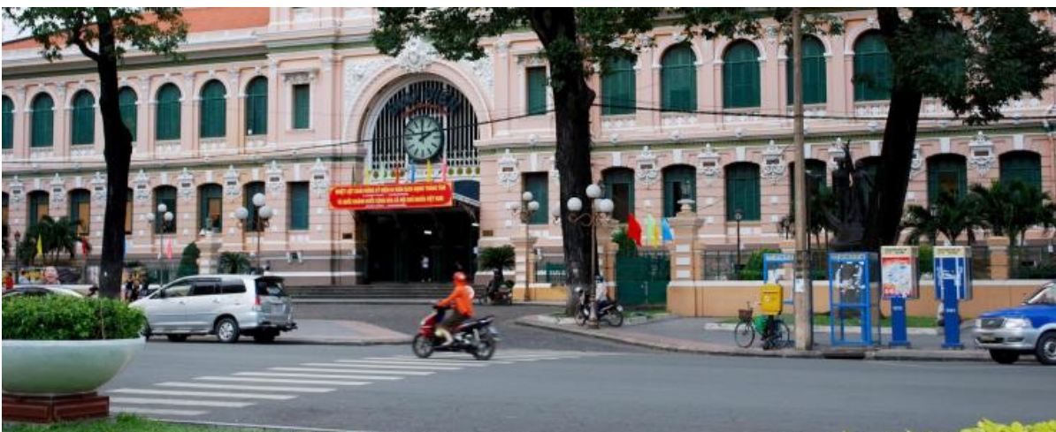
VIETNAM Ho Chi Minh City